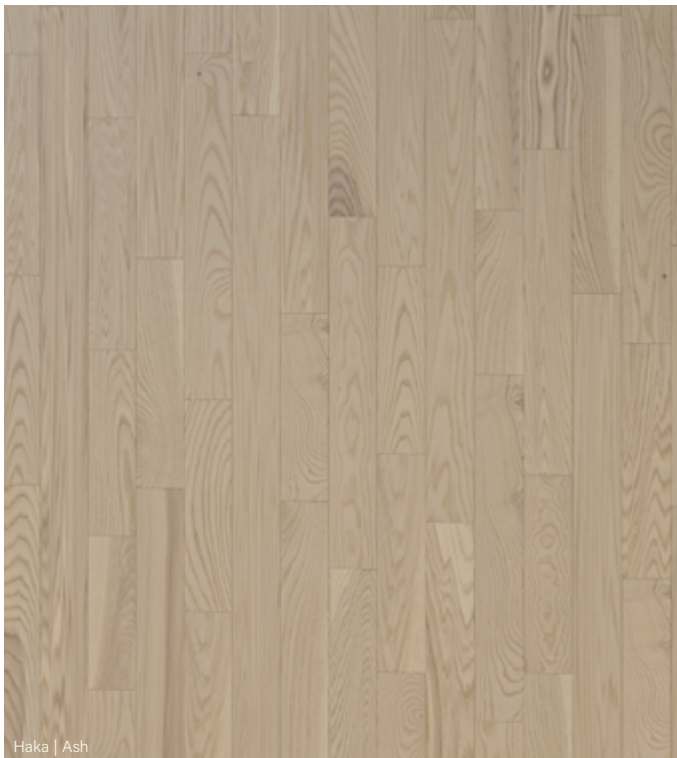
Haka | Ash

For more details, refer to the warranty for prefinished or pre-oiled products, visit our website ( pgflooring.com ) or contact the service ( pgservice@pgflooring.com ).